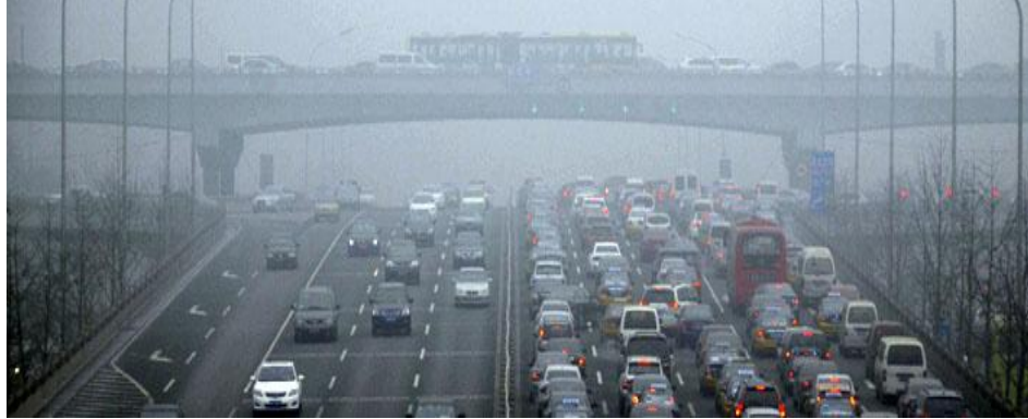
Fig. 2. Burning fossil fuels through Transport Sector

Carbon dioxide is the most dangerous greenhouse gas. Methane also can significantly damage the atmosphere. Methane is the primary component of natural gas, which, when burned, emits less carbon dioxide than coal. But unburned, when it is vented or leaked directly into the atmosphere, methane is far more potent, packing a much bigger punch over the first 20 years after its emitted. In other words, methane has the potential to undo much of the greenhouse gas benefits we stand to gain from switching from coal to natural gas. An aging pipeline infrastructure and a rapid expansion in natural gas development are just two reasons why methane emissions are increasing. But fully addressing methane emissions require us raising the bar on detection, as you can't fix what you don't measure. That's why we're tapping tech innovators to invent the next-generation of low-cost air pollution monitors to help companies identify methane leaks in real-time [10-12]. But lowering methane emissions alone is not enough as it also needs to address the other major causes of climate change: deforestation and the burning of traditional fossil fuels, like coal.