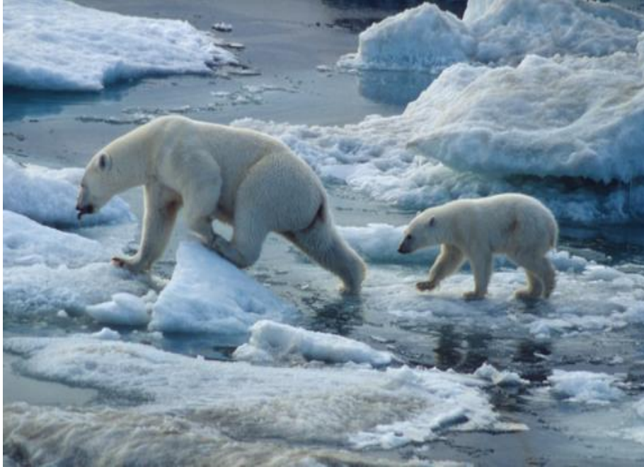
Fig. 3. Threatening for polar bears that depend on the ice for habitat