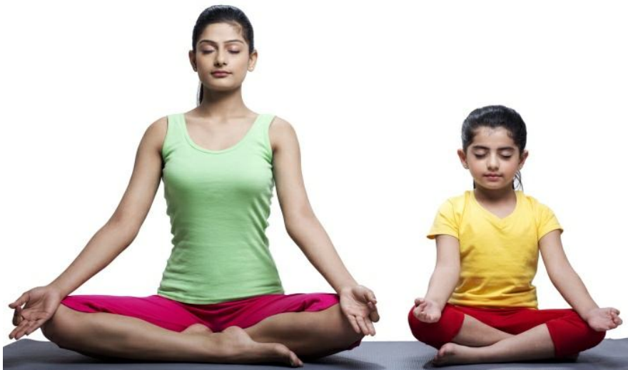
Figure 5.1: Ten Minutes Meditation With Eyes Closed