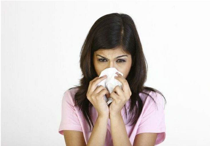
Figure 7.2: Suffering from cold and fever

mucus i.e. phlegm will also end. In the beginning you do 50-times. After that gradually increase it 10 to 15 times daily. If you want, you can increase its number to one thousand.