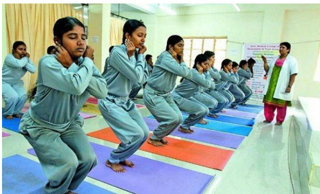
a) Students at Class Rooms in India

The practice of 'Superbrain Yoga' in foreign countries has been started regularly in the teaching world. whereas our sages had researched it thousands of years ago and implemented it smoothly in the Gurukul and elementary education system, which used to be implemented in basic education till the 1970s in India as shown in Fig.4.3 .