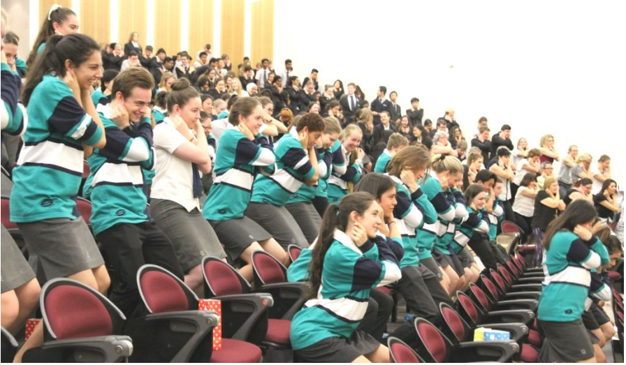
Figure 4.1: Superbrain Yoga Practice in the Classroom

It made me very happy that all the students became more focused, alert and interested in studies. This proves that by doing superbrain yoga in the middle of class timings, memory increases in the child. Therefore, it should not be considered a punishment, but it is a yoga connected on a scientific basis, which was discovered thousands of years ago in India and was implemented in the Gurukul education system.