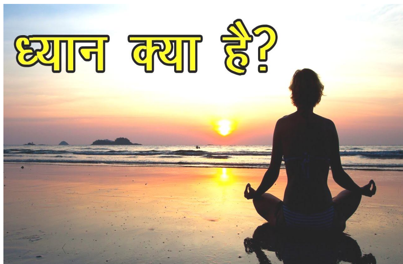
Figure 5.2: Meditation - The Way to Get Rid of Actions and Thoughts

Many saints, gurus or mahatmas suggest various revolutionary methods of meditation, but they do not tell that there is a difference between method and meditation. There is a difference between action and meditation. Action is a means, not an end. Action is a tool. Action is like a broom (cleaning tool).