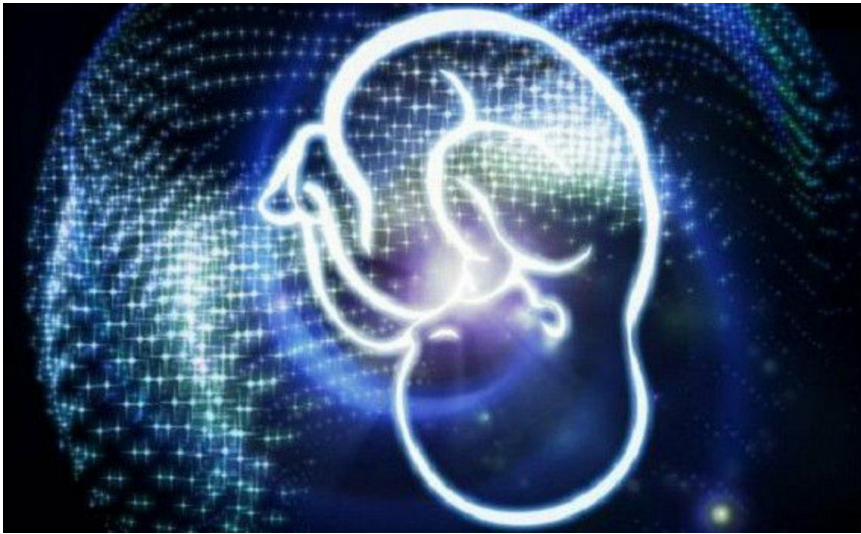
Figure 3.2: Head of the baby in the womb

http://www.youtube.com/watch?v=KSwhpF9iJSs