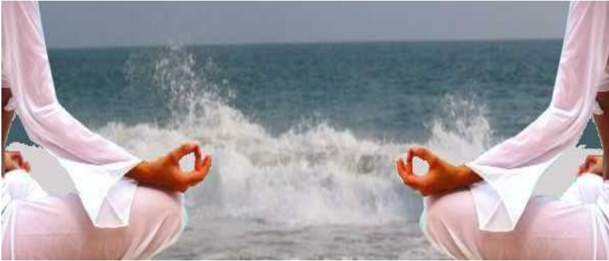
Figure 6.6: Vipassana - People Feeling The Breath Through The Nostrils

6.6.3 Vipassana is not a Method, it is Nature: There is no need for any kind of frills or living in solitude for doing Vipassana. Its good practice can be done only by staying in the crowd and noisy. While riding a bike, sitting in a bus, traveling in a train, traveling in a car, on the side of the road, in the shop, in the office, in the market, at home and while lying on the bed, keep doing this method anywhere and nobody knows. It will not work that you are meditating.