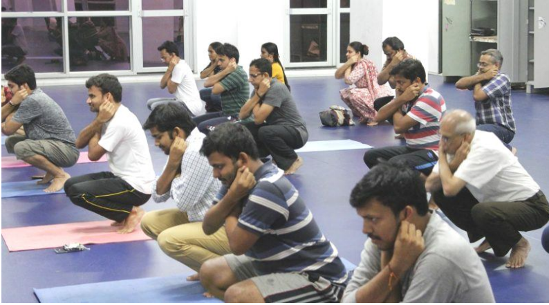
Figure 4.4: Superbrain Yoga Practice by Indian Common People