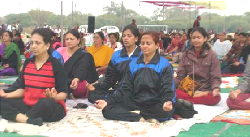
Figure 6.3: Involvement of adults, children and adults in meditation

For this, if we fix the time, place and object of meditation, then meditation is done better. Don't let other thoughts come to your mind while meditating. Thoughts will come again and again, but through effort these thoughts can be removed and meditation can be done. By doing regular meditation, you can easily see the results in your everyday life by increasing the sharpness of the intellect, increasing the memory power, increasing self-confidence, not losing the balance of mind in adversity.