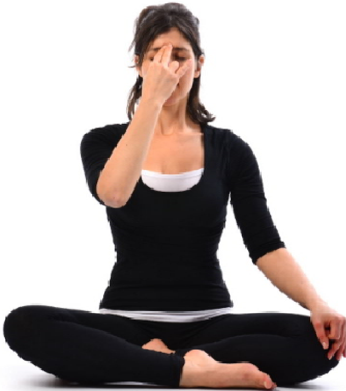
Figure 6.4: Nasal Vision Pose

This awakens the Muladhara chakra because the Ida, Pingala and Sushumna nadi, which are located between the two eyes, have gone to the Muladhara.