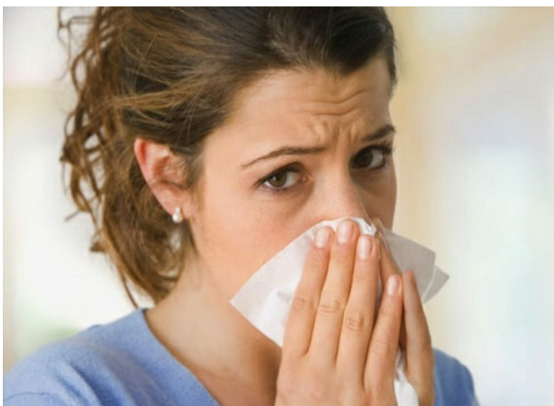
Figure 7.1: Suffering from cold and fever

7.2.1 Meditation to Prevent Colds and Fever: According to a study from the University of Wisconsin-Madison, adults who meditated or did light exercise like walking were less likely to suffer from colds for eight weeks than those who did not. The ones who didn't do anything like that. Earlier studies also found that meditation improves mood and reduces stress, as well as improves immunity.