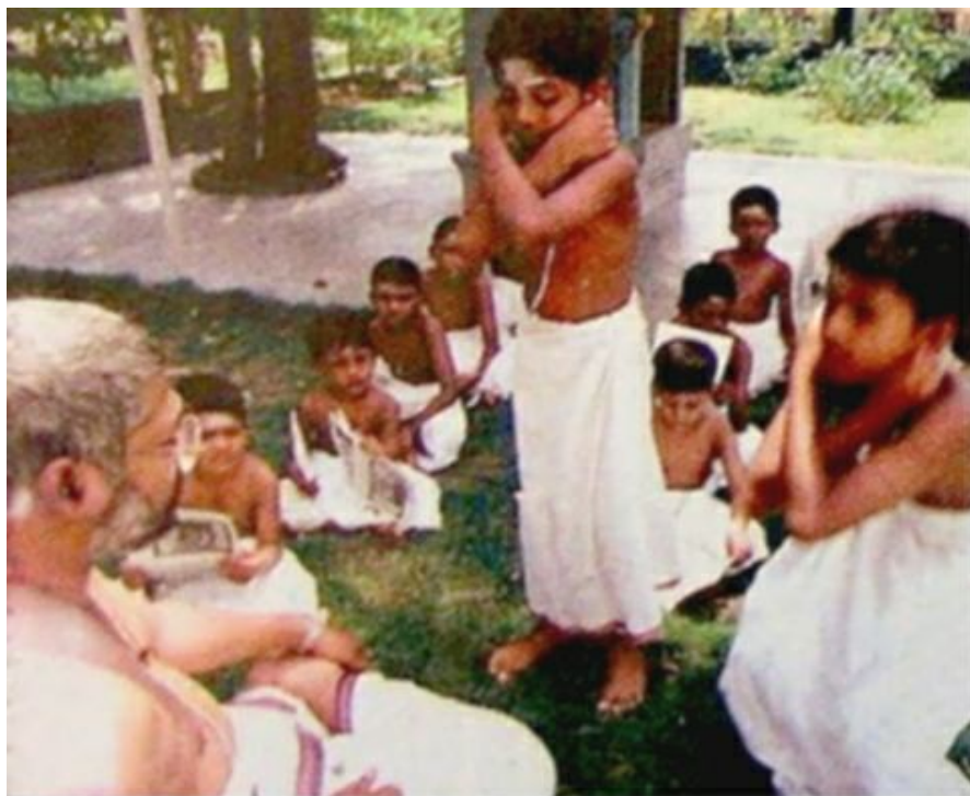
Figure 3.1: Sit-Ups in Gurukul

It is a type of exercise that helps in increasing the blood flow to the left and right sides of the brain. This results in the activation of memory cells. It also improves the functioning of the brain, enhances memory and stimulates the neuro cells of the person. However, when you hold the earlobes, it depresses the essential acupressure points. This process helps in sharpening the memory. It also helps children with disabilities to develop autism and improve Asperger syndrome.