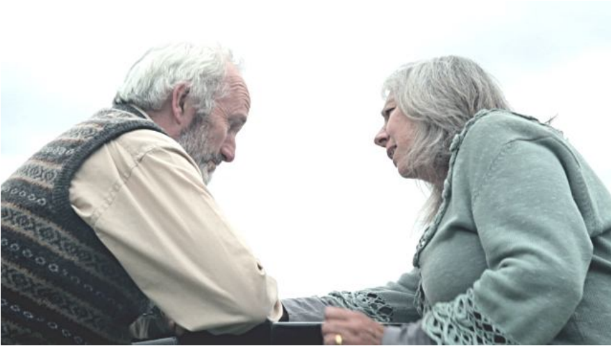
Figure 1: Mental patients with stress

Some times you experirnce that if something is infront of you it develops irritation / tension in the mind or anger. Try to keep yourself away from such things as too much stress can lead to depression. The depression always weakens your memory power and you cannot concentrate on anything. To avoid this, it will be necessary to consult a doctor ( Fig. 1 ).