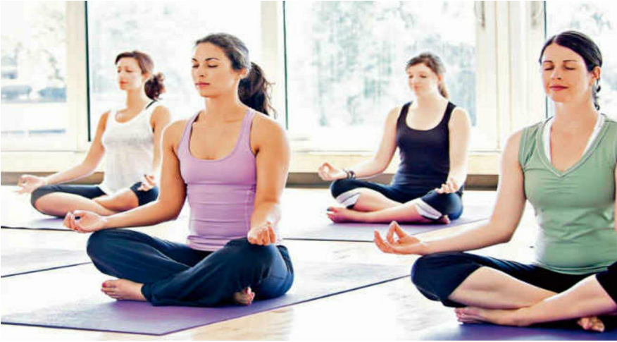
Figure 6.5: Amazing Experiences of Meditation

In our initial meditation experience, we experienced that darkness first appears between the eyebrows. In the dark somewhere blue and then somewhere yellow starts appearing. Blue is the color of the command wheel and the soul. Only the soul is visible in the form of blue color. Yellow is the light of the soul. Other colors are derived from the effect of visuals and energy. With continuous meditation, all the colors are removed and only blue, yellow or black color remains. Now, during this time, whatever the imagination or the movement of thoughts is happening in our mind and brain, according to that the scenes keep getting created. At some places, layers of memories keep opening up, but the meditator gets speed just by concentrating on meditation. Only an experience of deep darkness and peace can end thoughts and mental agitations forever.