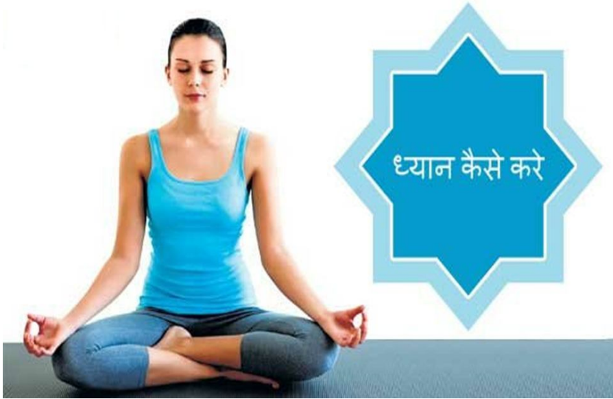
Figure 6.1: How to Meditate

6.1.1 Importance of Breathing Movement: In yoga, the movement of breath has been recognized as an essential element. This is how we are connected to the inner and outer worlds. The speed of breathing changes in three ways – 1). Attitude, 2). Atmosphere, 3). Body movement. In this, the speed of breathing is more driven by the mind and brain. Just as there is a huge difference in its speed between anger and happiness.