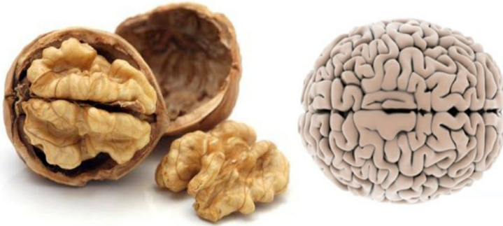
Figure 2: Walnut shape matches the brain