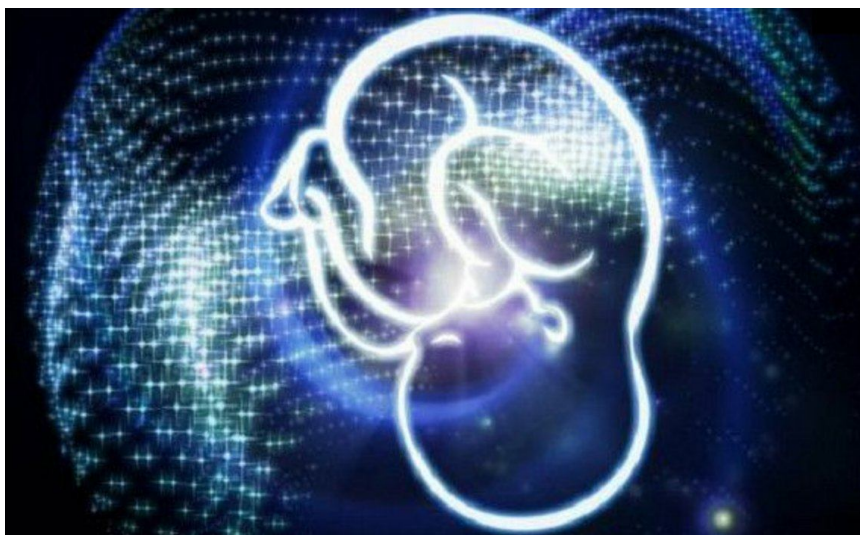
Figure 3.2: Head of the baby in the womb

http://www.youtube.com/watch?v=KSwhpF9iJSs