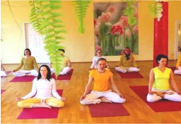
Fig. 5.3: Yogis Meditating While Sitting In Siddhasana